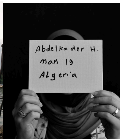
From left to right: actions in the UK; Ioannina, Greece; Timișoara, Romania

Thanks to UNITED Against Refugee Deaths for making and sharing the list of deaths, and to Wij Doen Mee and XY Actiefonds for their donations.