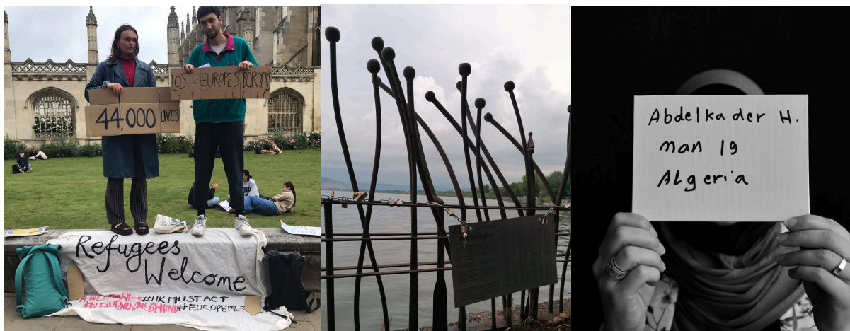
From left to right: actions in the UK; Ioannina, Greece; Timișoara, Romania

In Romania, Greece, the United Kingdom, Portugal, Poland, Belgium, Ireland and Germany, memorial services were held where the names of the deceased were read aloud or written down.